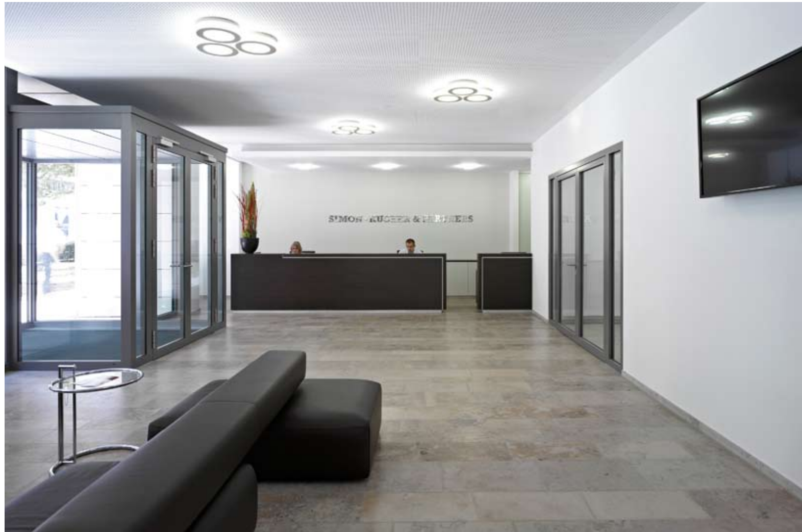
↑ | Lobby, and reception ↓ | Section